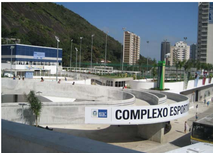
This sports facility was recently built adjacent to Rocinha and the children living in the favela have free access to the facility's swimming pool, soccer field, skate park, martial arts, and reading and computer classes

I am eternally grateful for the scholarship that I received from Merritt Community Capital. If there is a way that I can help MCC with green building as it relates to affordable housing, policy, training programs, outreach, etc. please let me know. In my work, I always cycle back to the concept of equity and strive to increase opportunities for people, while increasing sustainable development goals."